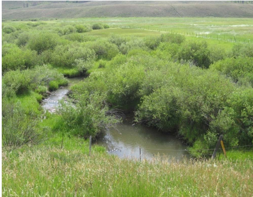
Tenmile Creek at confluence with Fraser River, Granby County

A relatively small tributary to the Fraser River, Tenmile Creek joins the Fraser River near the Town of Granby. The downstream 1.5 miles of Tenmile Creek are flat, sinuous and supports extensive meadow wetlands.