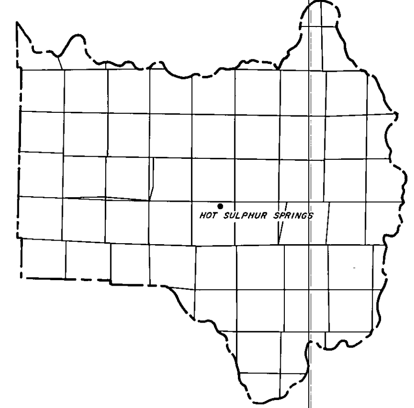
GRAND COUNTY Location Map