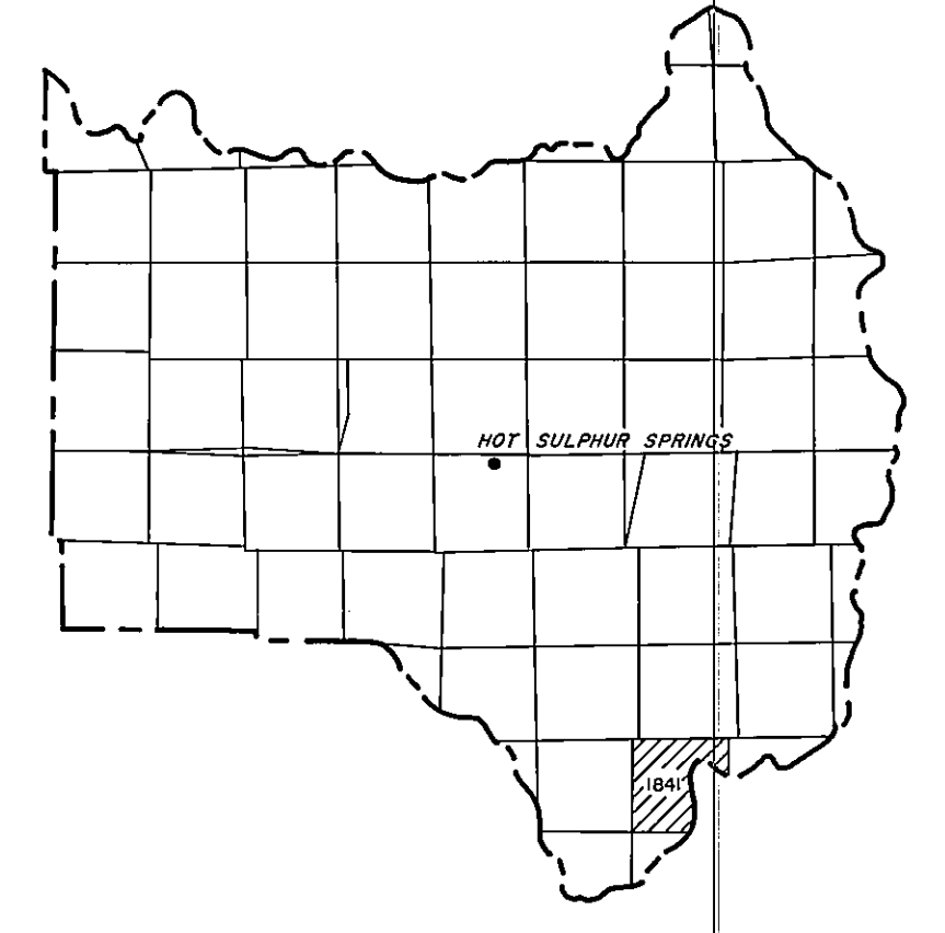
GRAND COUNTY Location Map