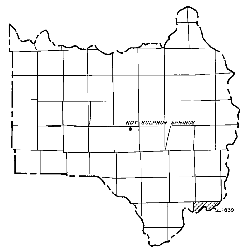
GRAND COUNTY Location Map