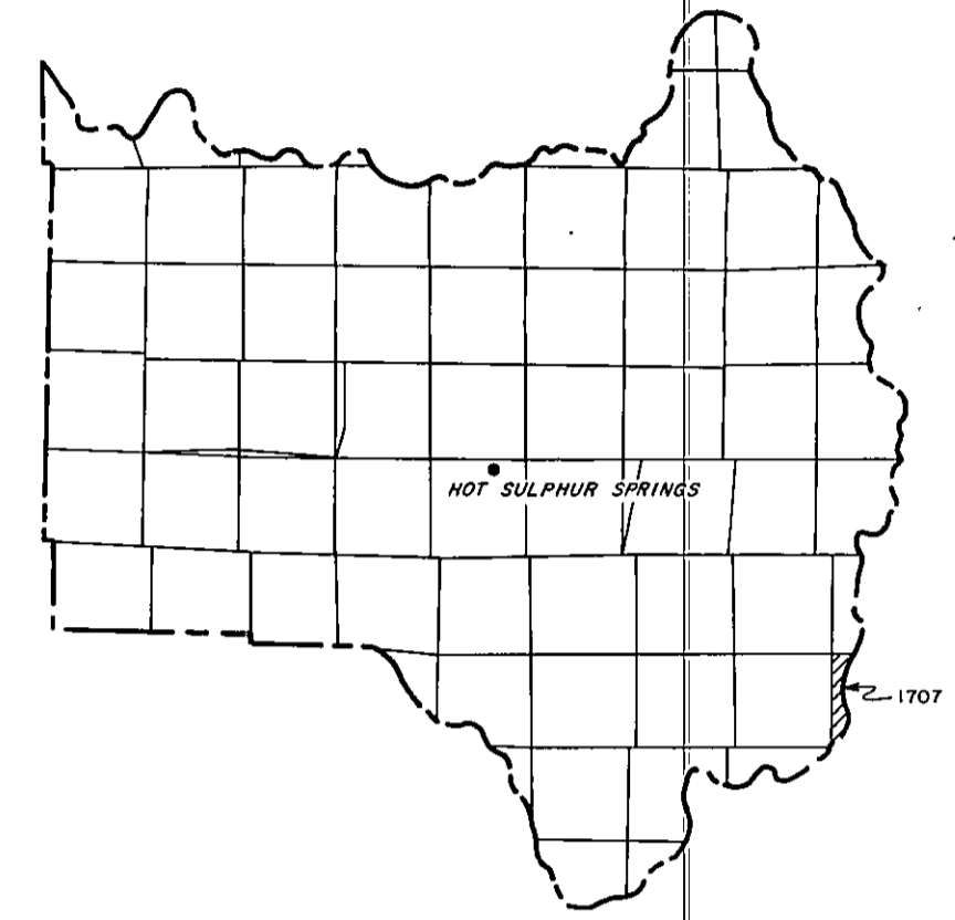
GRAND COUNTY Location Map