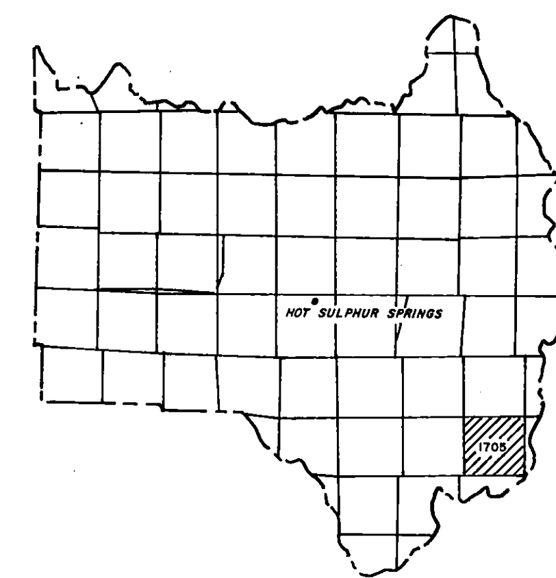
GRAND COUNTY Location Map