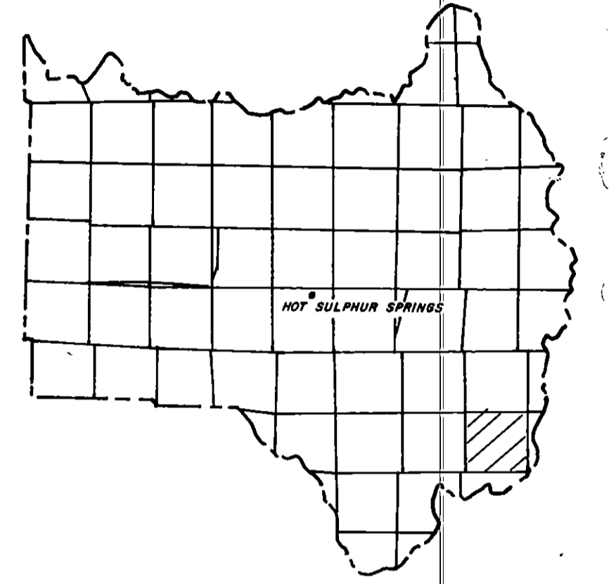
GRAND COUNTY Location Map