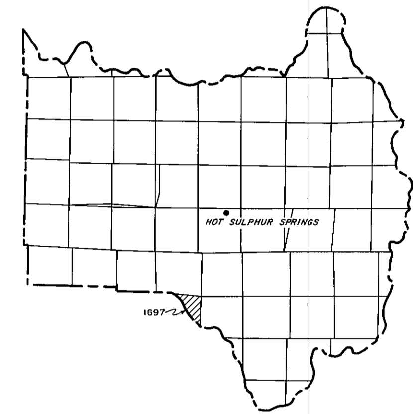
GRAND COUNTY Location Map