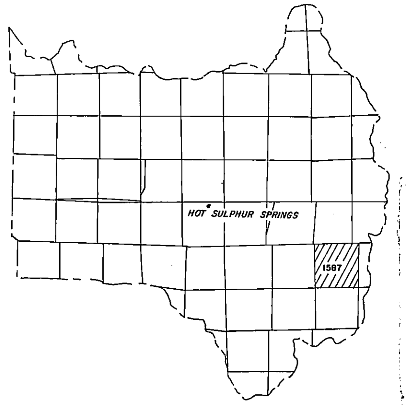
GRAND COUNTY Location Map