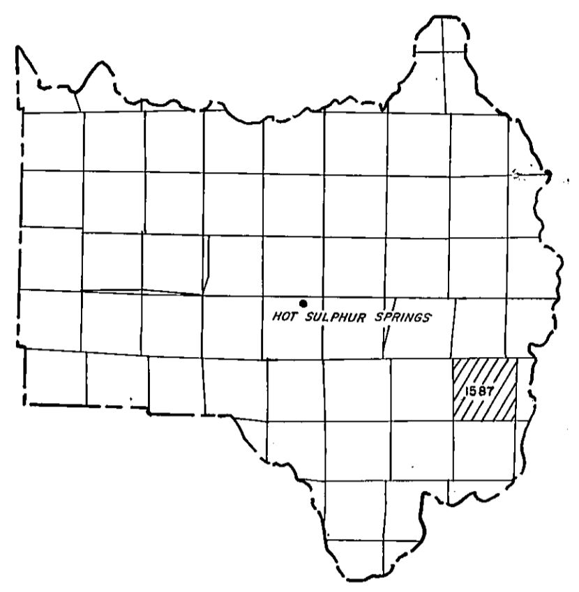
GRAND COUNTY Location Map