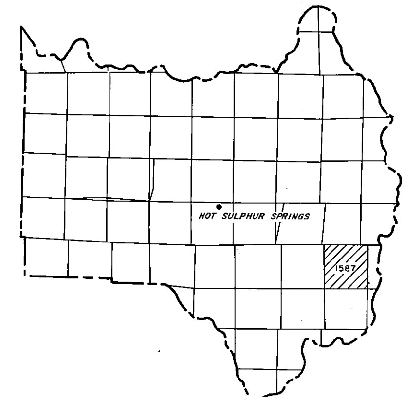
GRAND COUNTY Location Map