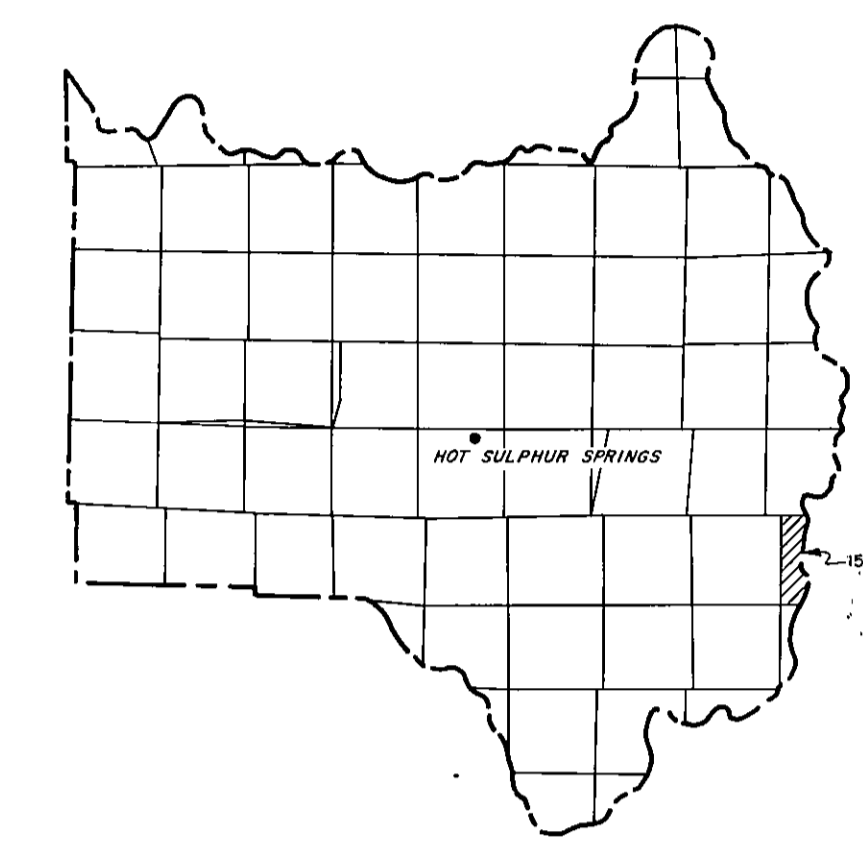
GRAND COUNTY Location Map