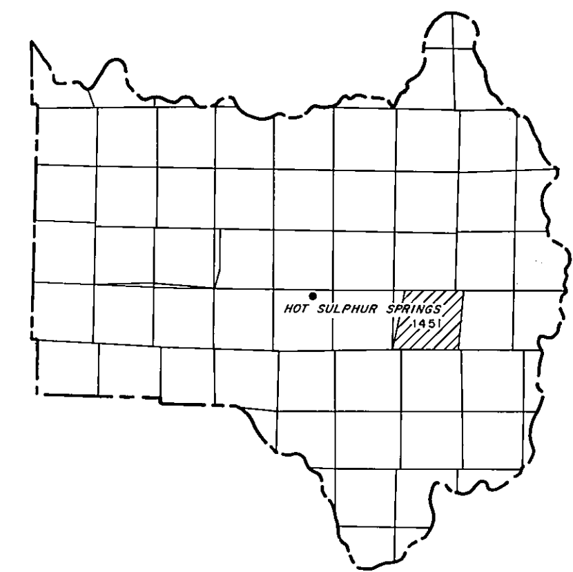
GRAND COUNTY Location Map