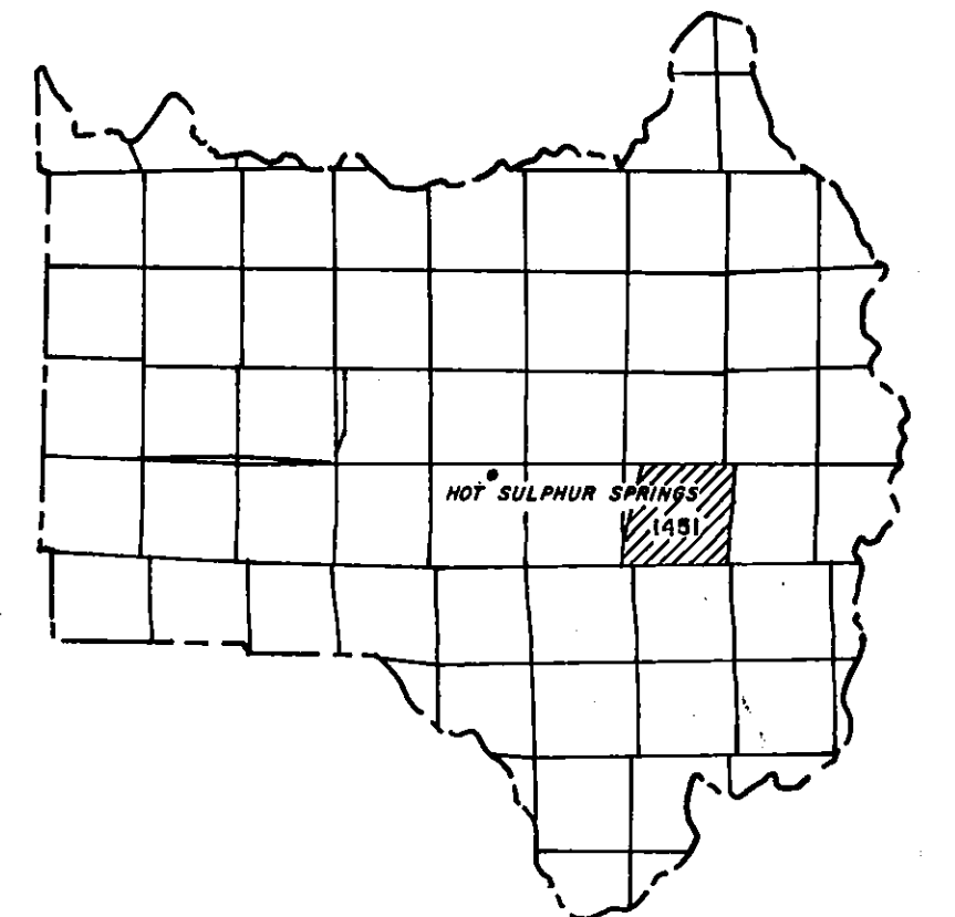
GRAND COUNTY Location Map