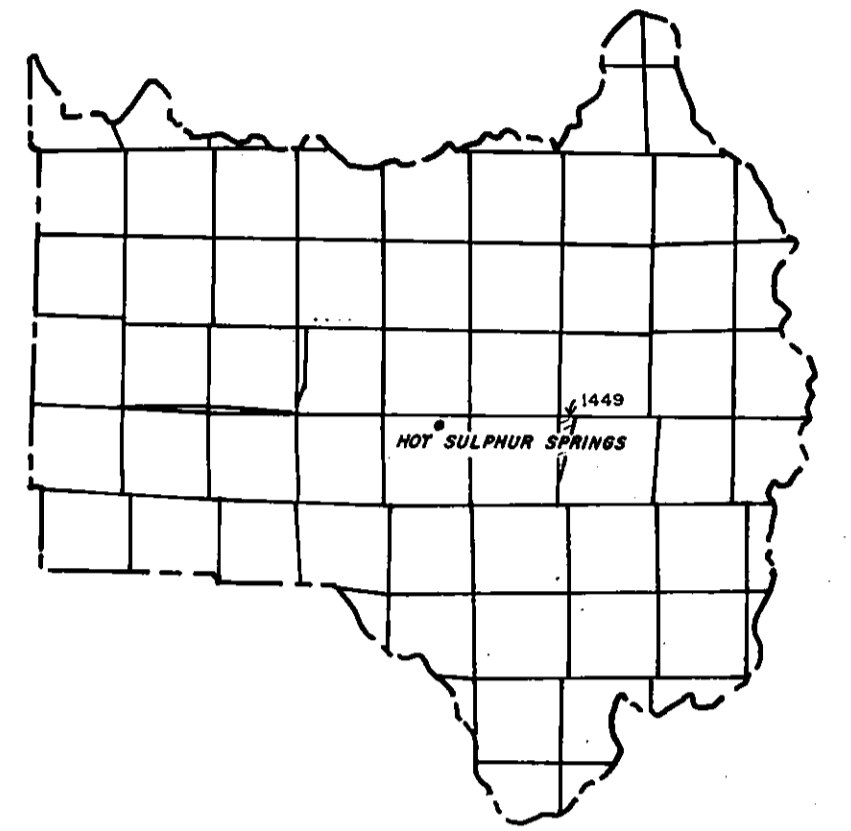
GRAND COUNTY Location Map