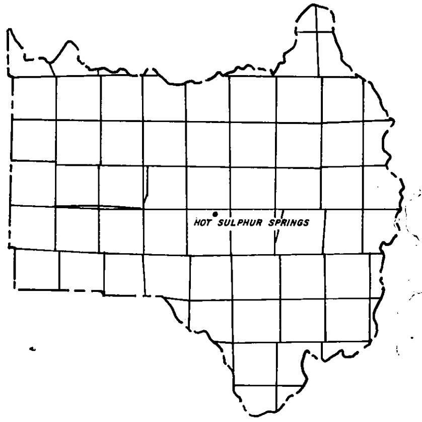
GRAND COUNTY Location Map