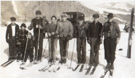
Pictured above: Skiing has historically been a favorite past time here in Grand County, as evidenced by the young men in this black and white picture from the mid-1900s.