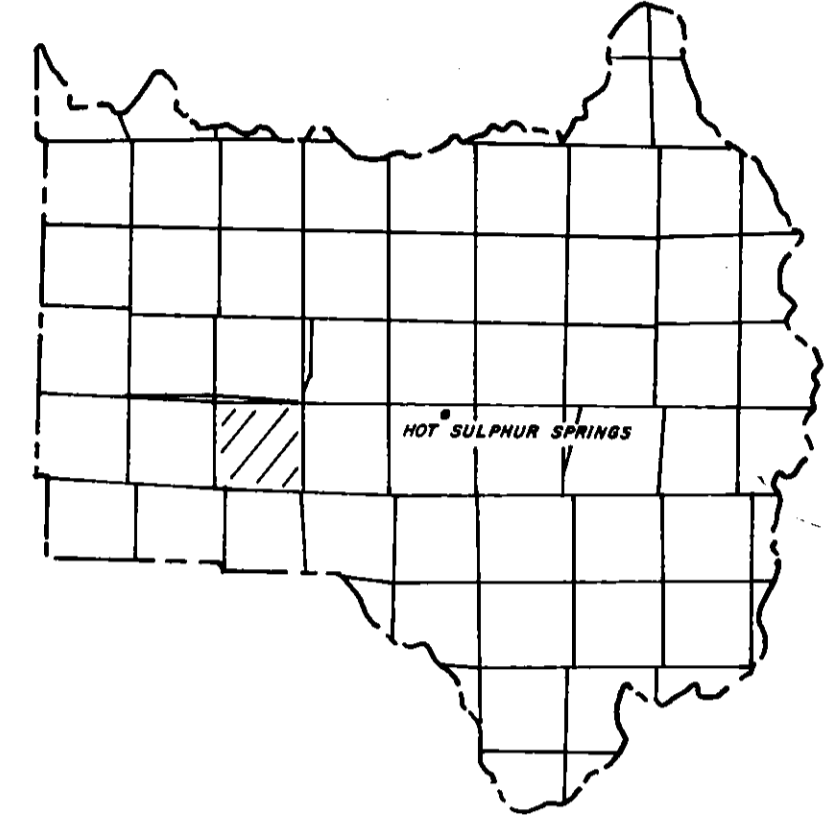
GRAND COUNTY Location Map