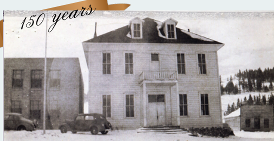
Pictured above: The only known photo of all three Grand County courthouses together - the original one-story log cabin used from 1891 to 1902 on the far right, the second courthouse built in 1902 in the middle, and the third, constructed in 1936, which is the present day Administration Building.

Full list of bills being followed during this Legislative session.