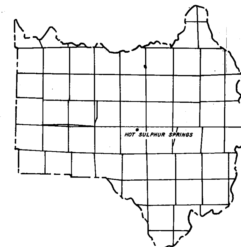
GRAND COUNTY Location Map