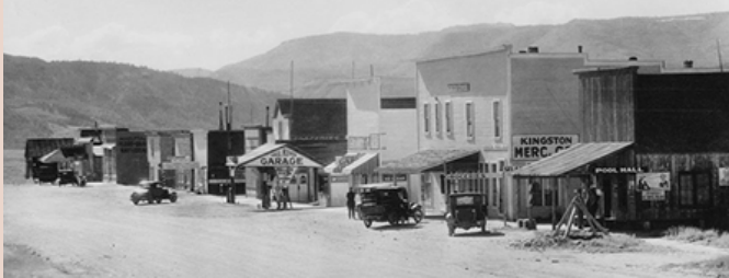
Pictured above: The Town of Kremmling, early 1900s.