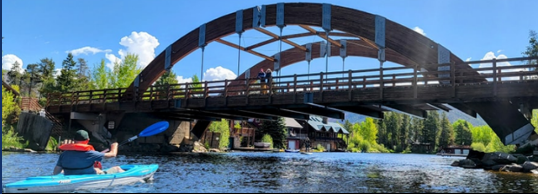
Summer is back!