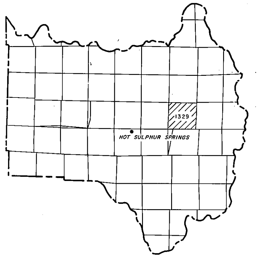
GRAND COUNTY Location Map