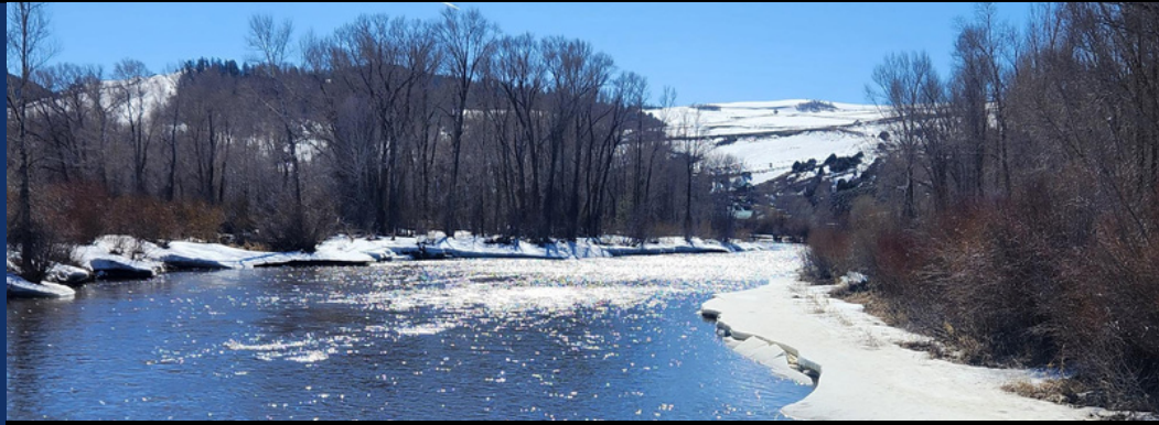
The mighty, muddy Colorado River on a bluebird spring day.