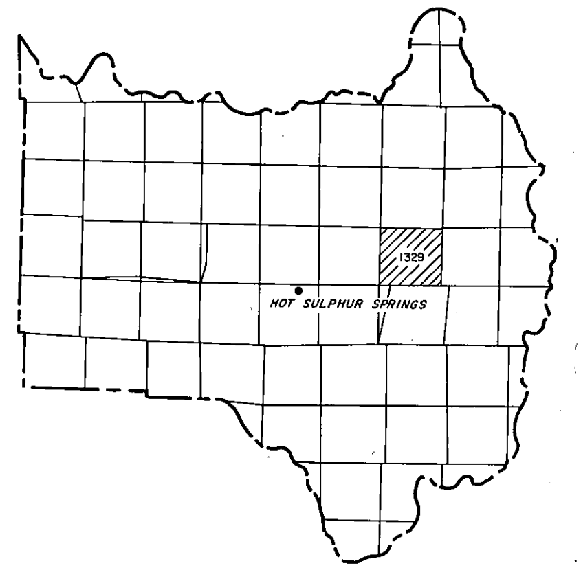
GRAND COUNTY Location Map