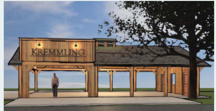
Conceptual drawing of the proposed new Kremmling Town Pavilion.