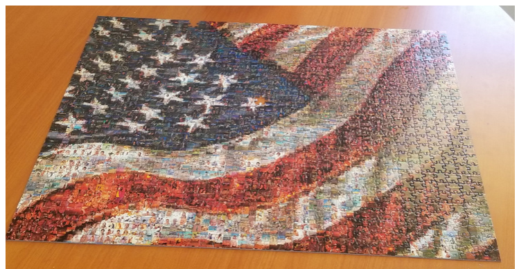
Shortly after the New Year, Administration Building staff started puzzling during their lunch hour. Thanks to the group effort, the puzzle was finally completed this week (minus two maddeningly missing pieces)!

Amended Final Plat, Lots 6 & 7, Block 4, Tabernash | Approved as presented.