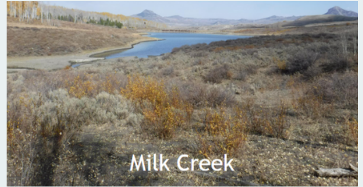
The Milk Creek State Trust Lands (17,801.15 acres north of Kremmling) was nominated for the State Land Board's Stewardship Trust.

The Stewardship Trust is not a conservation program; it is a management program. Grand County currently has one Trust property - the Kremmling Cretaceous Ammonite Locality. Sites nominated for the Stewardship Trust are evaluated on seven criteria: Rare Plants, Wildlife, Beauty, Open Space, Cultural & Geologic, Hydrology and Potential Conservation Areas.