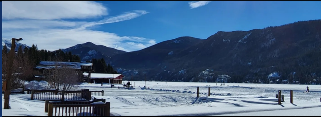
Winter in Grand Lake