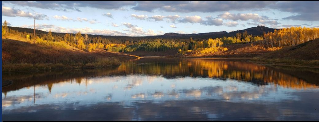
Photo of fall trees reflected on the water