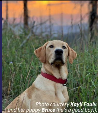
Photo courtesy Kayli Foulk and her puppy Bruce (he's a good boy!).