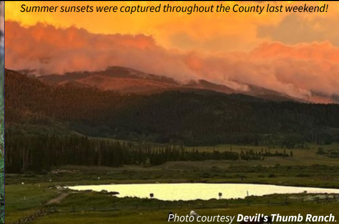
Summer sunsets were captured throughout the County last weekend!