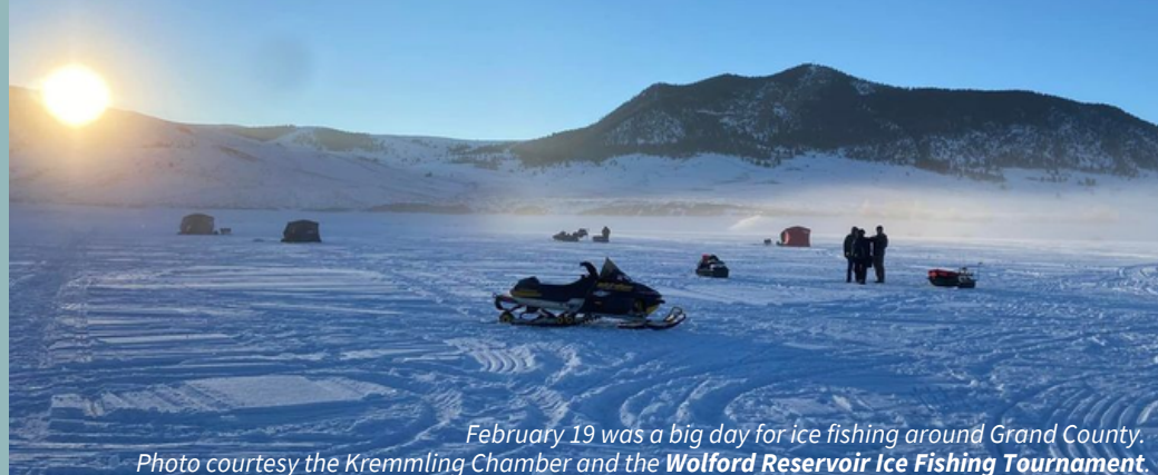
February 19 was a big day for ice fishing around Grand County.

News & Updates from Grand County's Board of County Commissioners