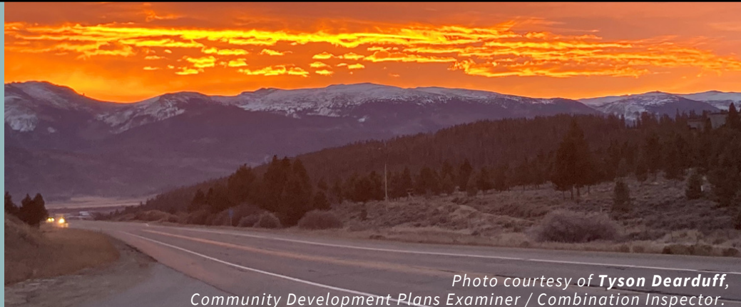
Photo courtesy of Tyson Dearduff , Community Development Plans Examiner / Combination Inspector.

News & Updates from Grand County's Board of County Commissioners