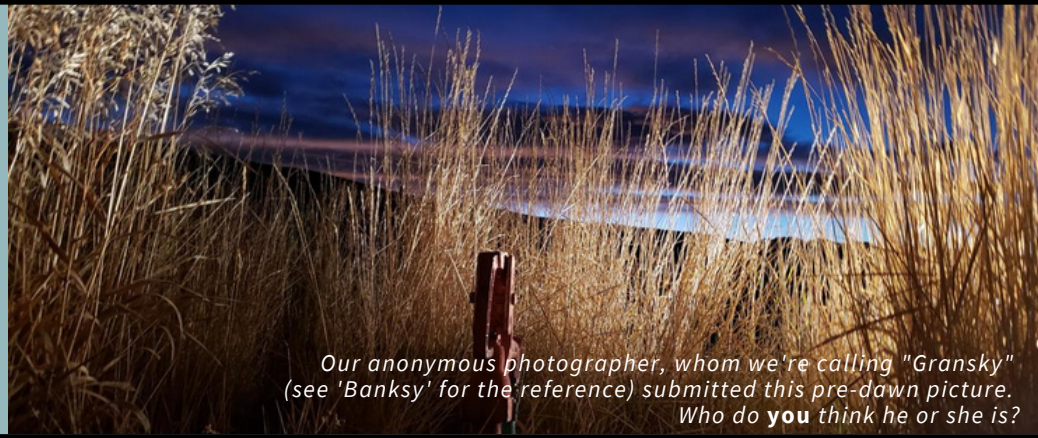
Our anonymous photographer, whom we're calling "Gransky" (see 'Banksy' for the reference) submitted this pre-dawn picture. Who do you think he or she is?

News & Updates from Grand County's Board of County Commissioners