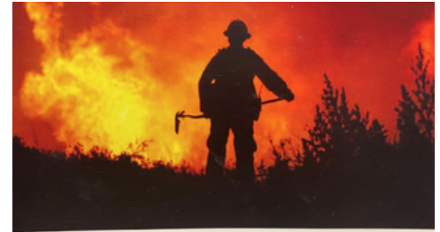
MOVING FROM AWARENESS TO ACTION MESSAGING TO MITIGATION, AND WORDS TO WORK

In response to the Wildfire Council's request for funding, the BOCC directed staff to work with the Council on a proposal for inclusion in the 2022 budget.