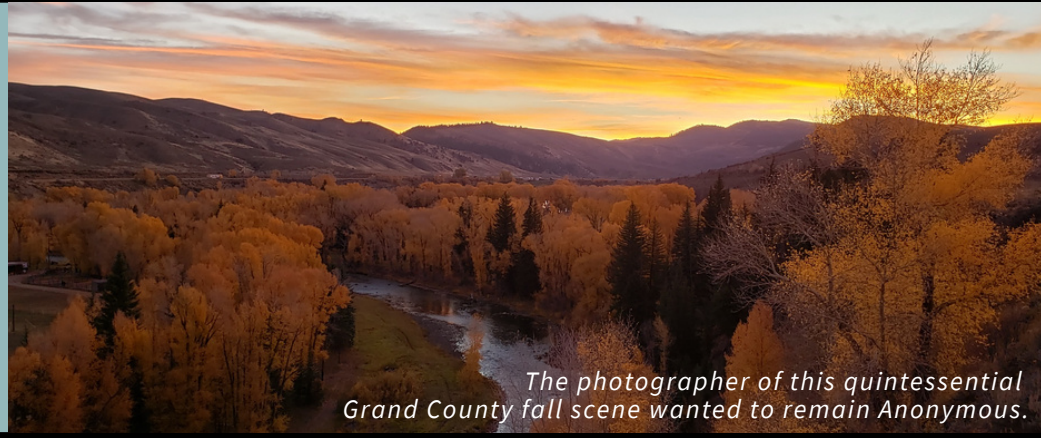
The photographer of this quintessential Grand County fall scene wanted to remain Anonymous.

News & Updates from Grand County's Board of County Commissioners