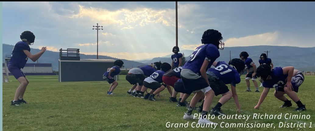
Photo courtesy Richard Cimino Grand County Commissioner, District 1

News & Updates from Grand County's Board of County Commissioners