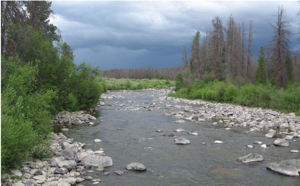
Colorado River North Fork at Shadow Mountain

This reach of the Colorado River connects Shadow Mountain and Granby Reservoir, both constructed as part of the Colorado-Big Thompson project. As such, flows in this reach are highly regulated. Often lake levels are such that approximately 3 miles of the reach are inundated and behaves as a backwater.