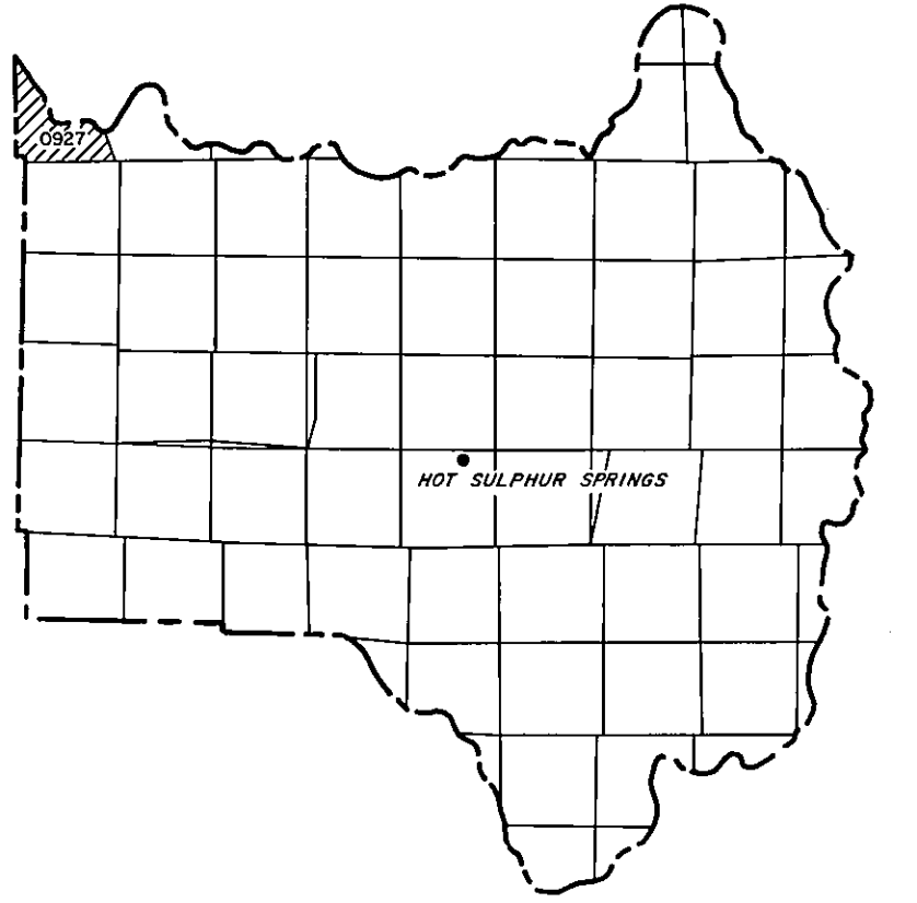
GRAND COUNTY Location Map